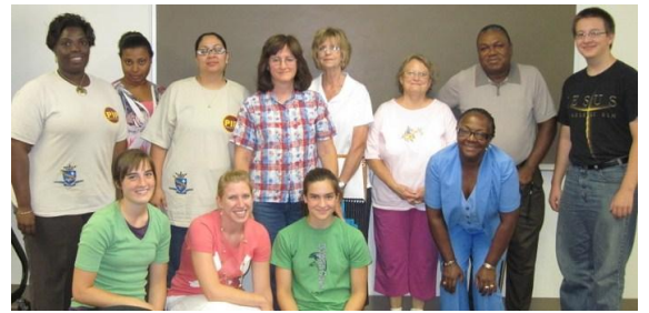
GNC Teachers at Quick Start Training in Austin

Some of the schools in need are: C.C. Mason Elementary in Leander and Travis Elementary in San Marcos.