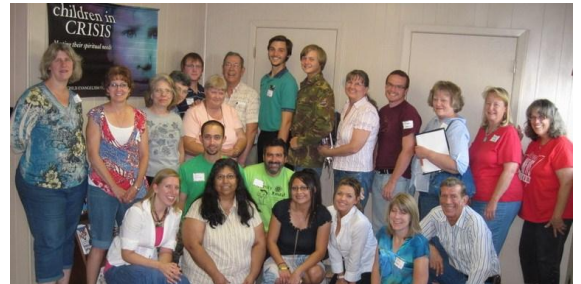
GNC Teachers at Quick Start Training at the CEF office in Martindale