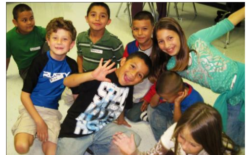
We love Good News Club in our school!